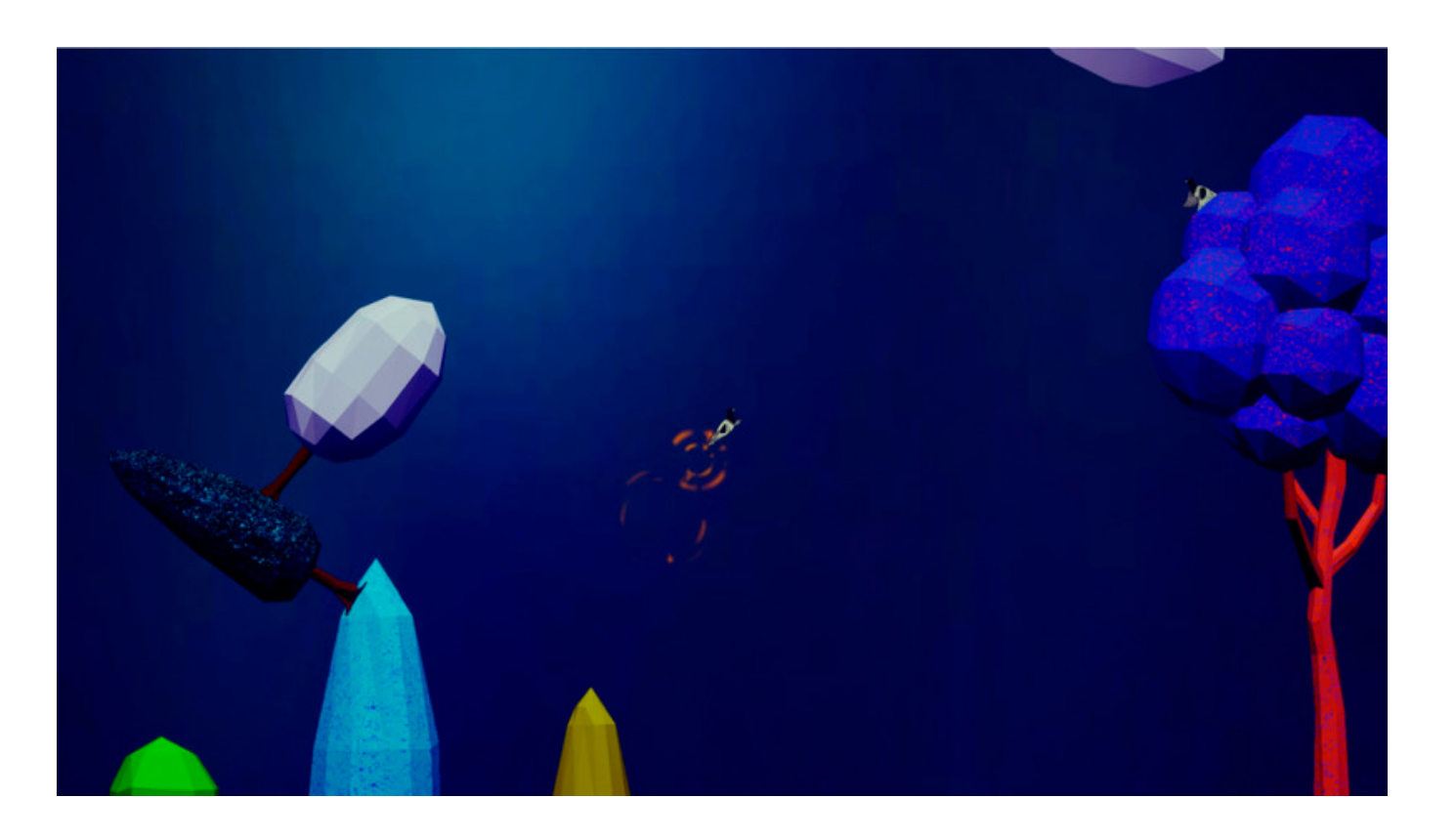
Flapping Over It Activation Code [Password]